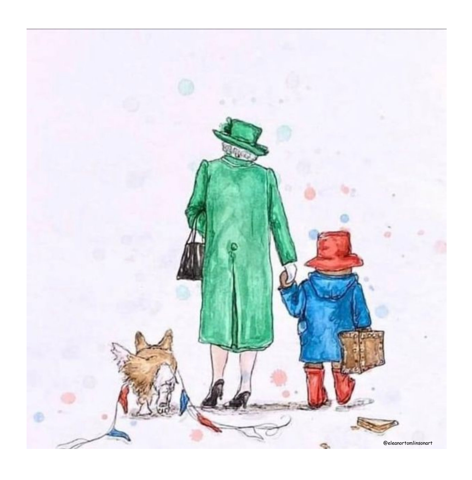
"And thank you. For Everything" ~Paddington Bear