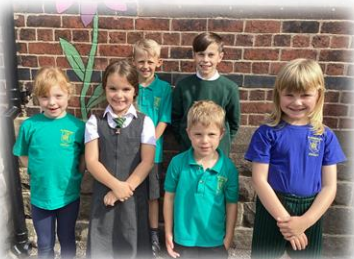
Work of the week