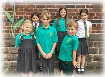
Stars of the week