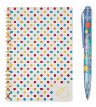
Pudsey Stationery Pens £1 Notepads £2

Our support for charitable causes is as a result of your generosity, however, we appreciate it may not always be easy to make contributions.